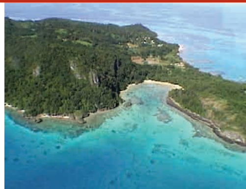
The Island of Naitauba

When I allow myself to feel the depth and profundity of His Gifts and of His Revelation, my heart breaks in gratitude that I was graced to be born in the time and place of the Perfect Incarnation of the Divine Person, and that I have been granted a relationship to that One that is unthreatened by anything whatsoever, certainly not by death.