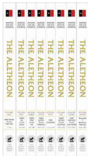
Boxed 8-book set of The Aletheon

Visit the Adidam Revelation online Magazine at http://global.adidam.org for ongoing celebration and study of Avatar Adi Da's remarkable Aletheon book. Allow its brilliance and depth to penetrate the heart and make full use of the Truth that flows from its pages.