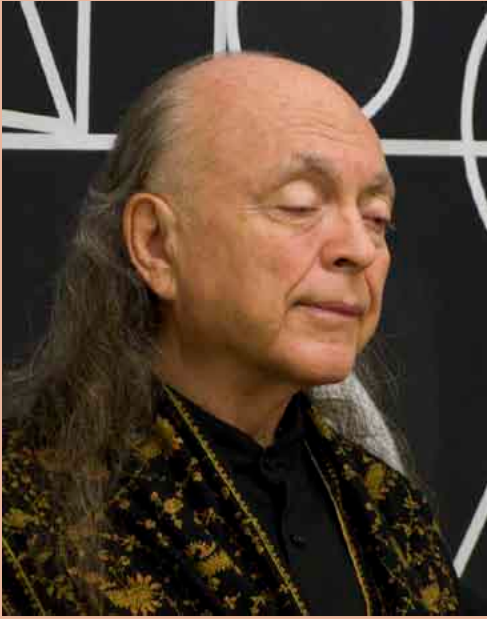
His Divine Presence, Avatar Adi Da Samraj