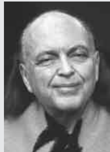
Avatar Adi Da Samraj

Six weeks $195 New class forming in October in Vancouver, BC